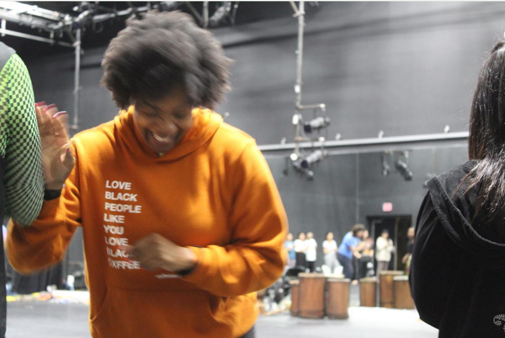
Scene from a Wednesday night Connection Jam.