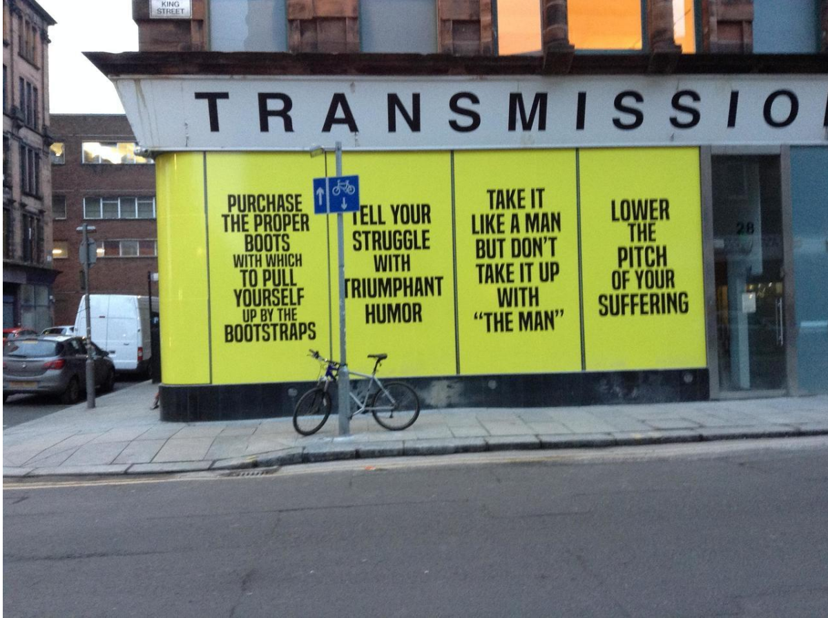
Streetview photo of a section of Rasheed's 2017 exhibit How to Suffer Politely (and other etiquette) at the Transmission Gallery in Glasgow, Scotland.