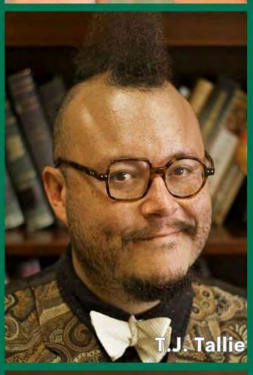
BLACK STUDIES IN SPRING