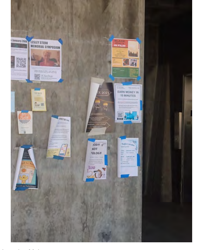
"Flier in the campus wild" Winter 2023.