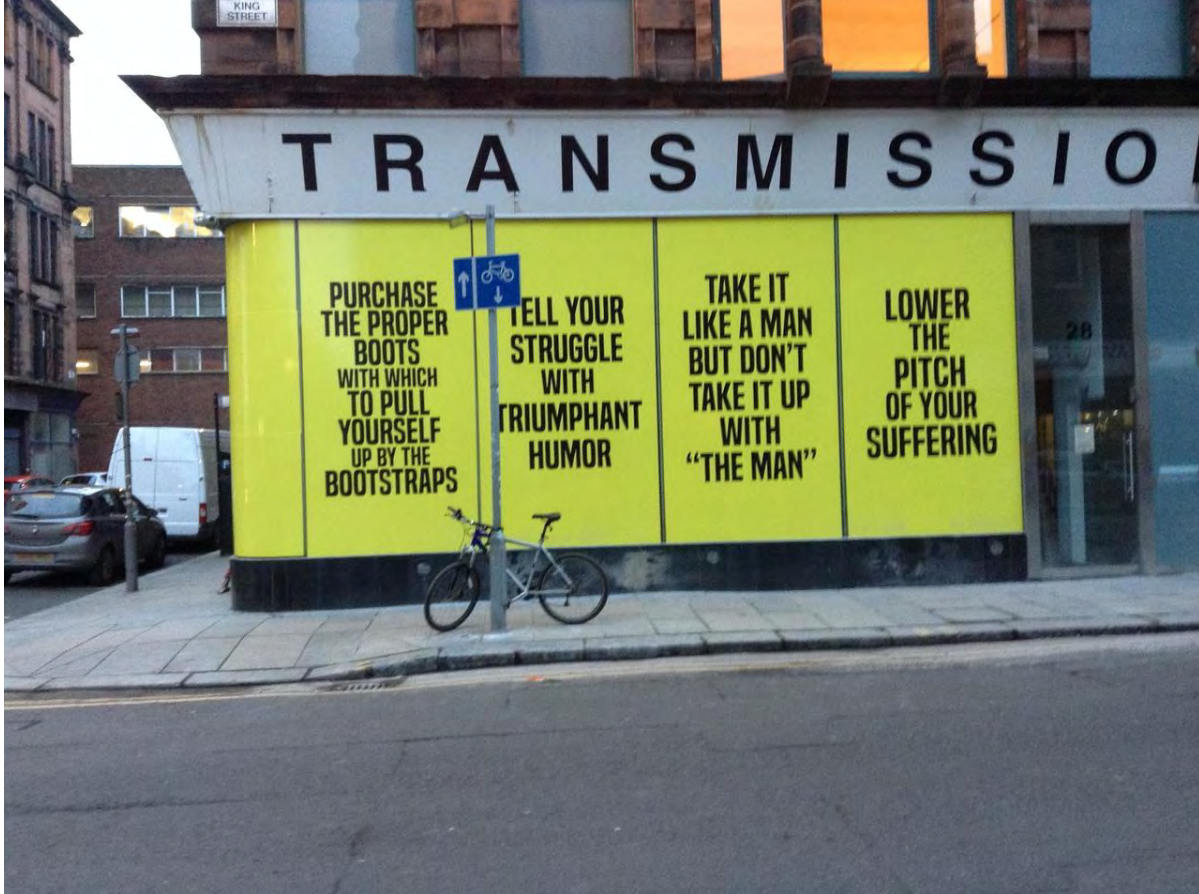
Streetview photo of a section of Rasheed's 2017 exhibit How to Suffer Politely (and other etiquette) at the Transmission Gallery in Glasgow, Scotland.