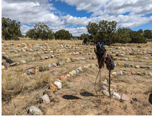
On the road with Naomi Nadreau (Visual Arts/MFA, student).

The photos feature work that Naomi made in The Labyrinth, New Mexico. Of their work, Naomi writes, "I have a visual arts practice utilizing found objects, natural materials, and ceramics evoking the otherness of self-possession and the pursuit of alternative means of existence through genres of Science Fiction and material." Of the landscape, Naomi asks, "[i]s there a place for Black people in the desert?"