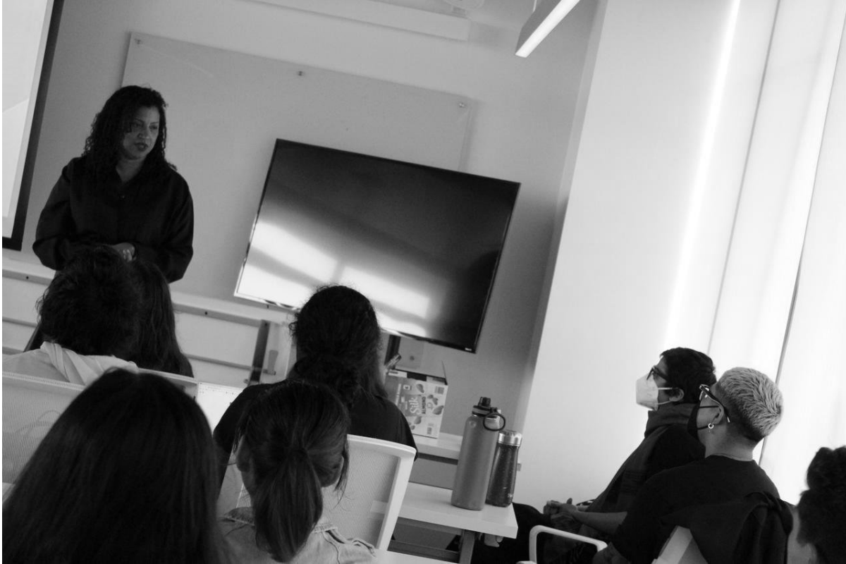
On the heels of the publication of her book To the Realization of Perfect Helplessness, recently awarded the 2023 PEN/Voelcker Award for Poetry, National Book Award-winning poet, artist, and scholar Robin Coste Lewis addresses a full house during the Sherley Anne Williams Writing Residency inaugural lecture in the spring of 2023, an event cosponsored by BSP and the UCSD Literature New Writing Series, and supported by UCSD Special Collections and the the Office of the Vice Chancellor for Equity, Diversity, and Inclusion.